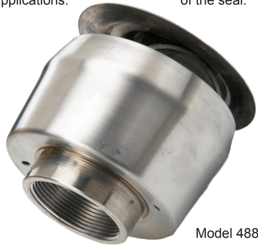
Model 4885 shown

PRES. 2.5-6 IN. W.C. VAC. 6-10 IN. W.C. .05 CFH @ +2 IN. W.C. .21 CFH @ -4 IN. W.C.